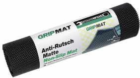
89010003 Non-slip mat GRIPMAT