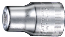
13180010 Bit holder