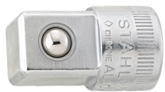
11030003 Square drive adapter