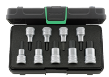
91332215 Screwdriver insert set