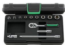
91221857 Socket spanner set