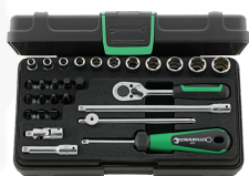
91222157 Socket spanner set