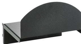
89010040 Cable holder