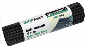
89010003 Anti-slip mat GRIPMAT