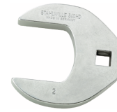
03501069 CROW-FOOT wrench heavy-duty