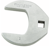
03501072 CROW-FOOT wrench heavy-duty