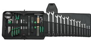
97830217 Agrar on-board tool set