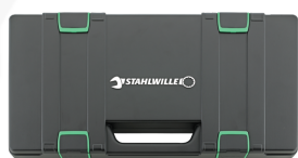
81271034 Tool case