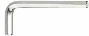
43150002 Hex key for socket head screws