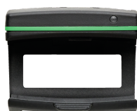
52110220 Bluetooth Low Energy module 714