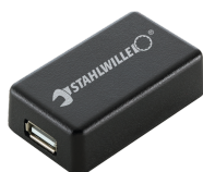
52110061 Interface adapter