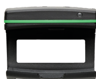
52110220 Bluetooth Low Energy module 714