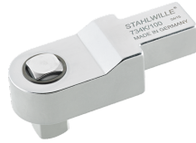
58243004 Calibrating square drive insert tool