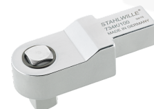
58243020 Calibrating square drive insert tool