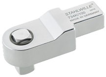
58243005 Calibrating square drive insert tool