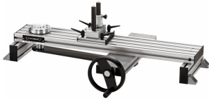
52110091 Mechanical calibration device