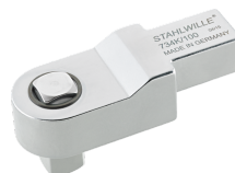
58243040 Calibrating square drive insert tool