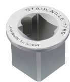
58521089 Square drive adaptor