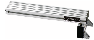
52110191 Extension unit for No.7791, 7794-1 and 7794-2 up to 1000 N-m