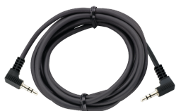
52110051 Jack cable