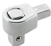
58240020 Square drive insert tool