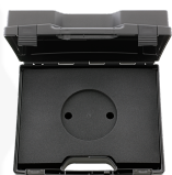
81500004 Plastic case, empty