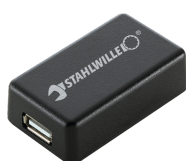
52110061 Interface adapter