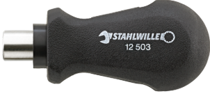
18110016 Bit holder