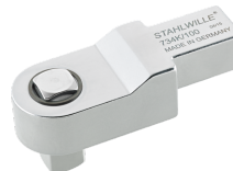
58243005 Calibrating square drive insert tools