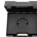
81500003 Plastic box, empty