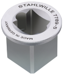
58524091 Square drive adapter