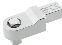
58243020 Calibrating square drive insert tools