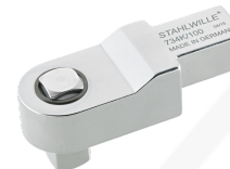
58243004 Calibrating square drive insert tools