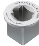
58521089 Square drive adapter