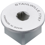
58521087 Square drive adapter