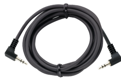
52110051 Jack cable