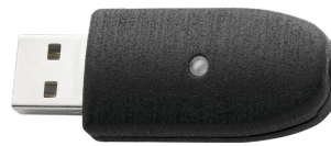
52111057 USB adapter