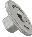
11030010 Square drive adapter