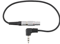
52110058 Lemo cable