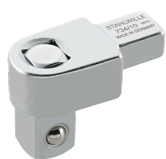
58240010 Square drive insert tool