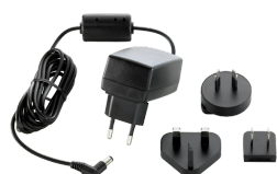
52110056 Mains adaptor