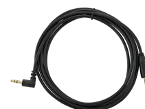
52110052 Spiral cable