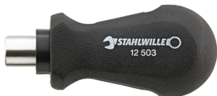
18110016 Bit holder