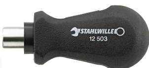
18110016 Bit holder