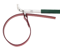
76500001 Strap wrench