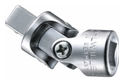
12020000 Universal joint