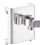
81485006 Spring clip