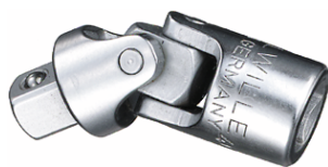
11020000 Universal joint