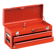
81091002 Tool box