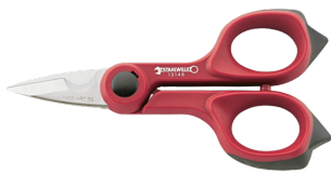
75270003 Wire cutter