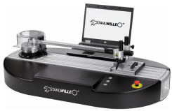
52111192 Calibration system