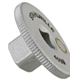
11030010 Square drive adapter