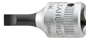
01280012 Screwdriver socket