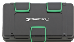
81251019 Socket set