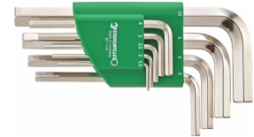
96431500 Set of hex keys for socket head screws