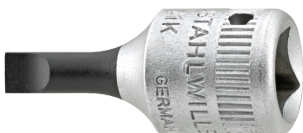
01280010 Screwdriver socket