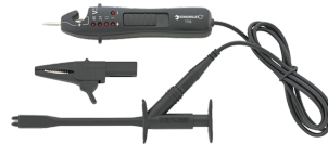
77560002 Automotive voltage tester set