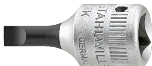
01280006 Screwdriver socket