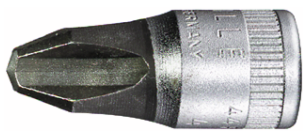
01290003 Screwdriver socket