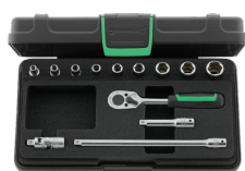
91221857 Socket spanner set