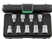
91332215 Screwdriver insert set