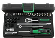
91222157 Socket spanner set