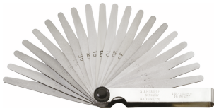
74240005 Precision feeler gauges