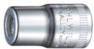
12180030 Bit holder