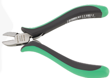
67076000 Electronic side cutter