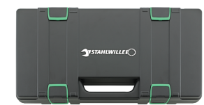
81271034 Tool case