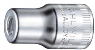
12180026 Bit holder