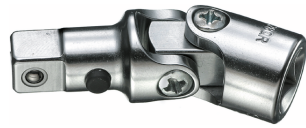
12021000 QR universal joint