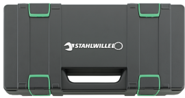
81251014 Tool case