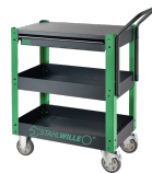
81300612 Service trolley