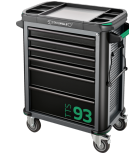
81200154 Tool trolley