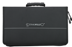
81230103 Textile bag