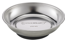
90432779 Magnetic tray