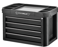
81200157 Tool box