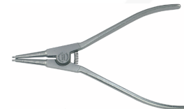
65454002 Circlip plier for outside circlips