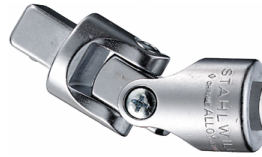
13020000 Universal joint