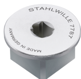
58521087 Square drive adaptor