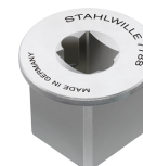
58521088 Square drive adaptor