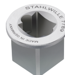
58521089 Square drive adaptor