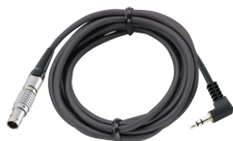
52110054 Cable for No.7728