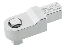
58243004 Calibrating square drive insert tool