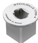
58524090 Square drive adaptor