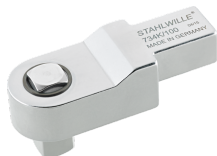
58243005 Calibrating square drive insert tool