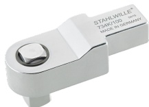
58243020 Calibrating square drive insert tool