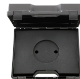
81500003 Plastic case, empty