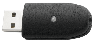
52111057 USB adapter