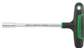
18093016 Bit holder