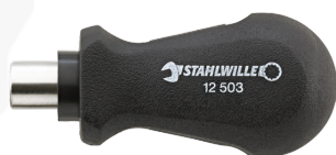
18110016 Bit holder