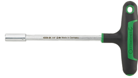
18093016 Bit holder