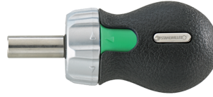
18120002 Bit ratchet screwdriver