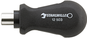
18110016 Bit holder