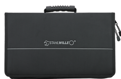
81230103 Textile bag