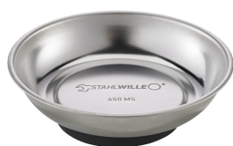
90432779 Magnet tray