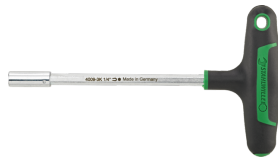
18093016 Bit holder