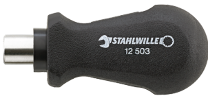
18110016 Bit holder