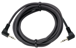
52110051 Jack cable