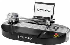
52111192 Calibration system