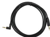
52110052 Spiral cable