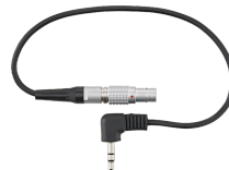
52110058 Lemo cable