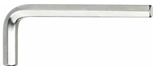
43150002 Hex key for socket head screws