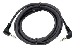
52110051 Jack cable