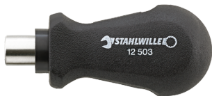
18110016 Bit holder