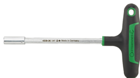
18093016 Bit holder