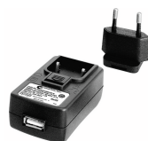
52110063 USB mains adapter