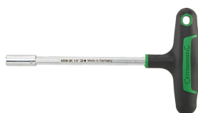
18093016 Bit holder