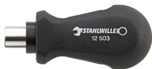
18110016 Bit holder