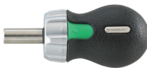
18120002 Bit ratchet screwdriver