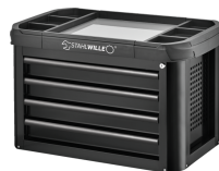
81200157 Tool box