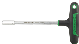
18093016 Bit holder