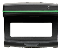
52110220 Bluetooth module für torque wrenches