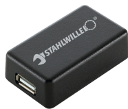
52110061 Interface adaptor