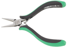
67116000 Electronic needle nose pliers