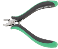
67086000 Mini electronic diagonal cutter