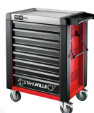
81200168 Tool trolley