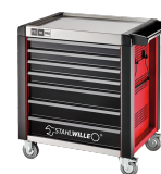
81200171 Tool trolley