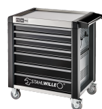
81200169 Tool trolley