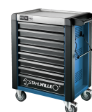
81200167 Tool trolley