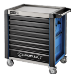
81200173 Tool trolley