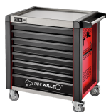
81200174 Tool trolley