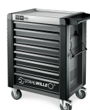
81200166 Tool trolley