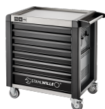
81200172 Tool trolley