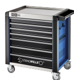
81200170 Tool trolley