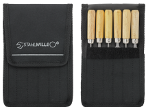
72230001 Set warding files