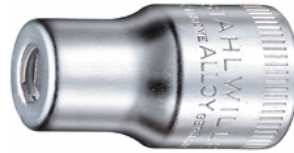
12180026 Bit holder