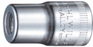
12180030 Bit holder